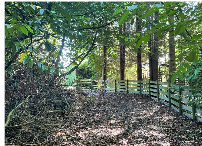
Vehicular access to walled garden/lands from lane