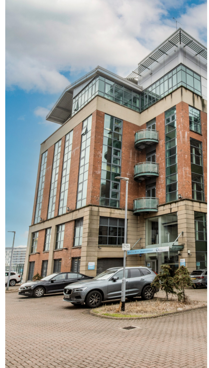
Images for entire property. Photographs for indicative purposes only.